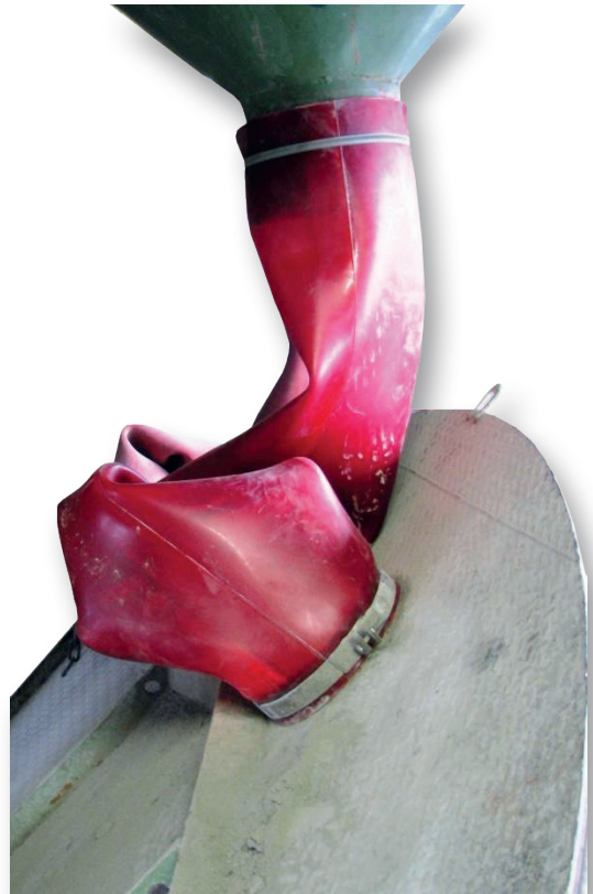
sleeve mixer ventilation