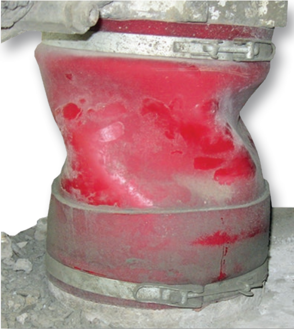
transfer sleeve cement scale / mixer