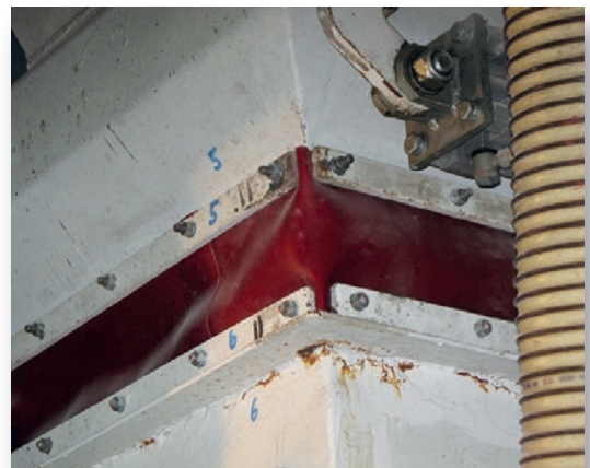
transfer sleeve aggregate scale / mixer