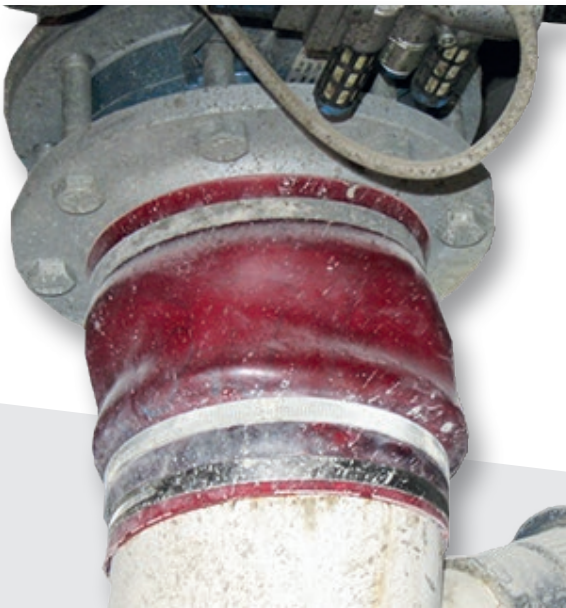
transfer sleeve water level / mixer